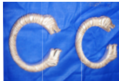
Nang or Nagchi